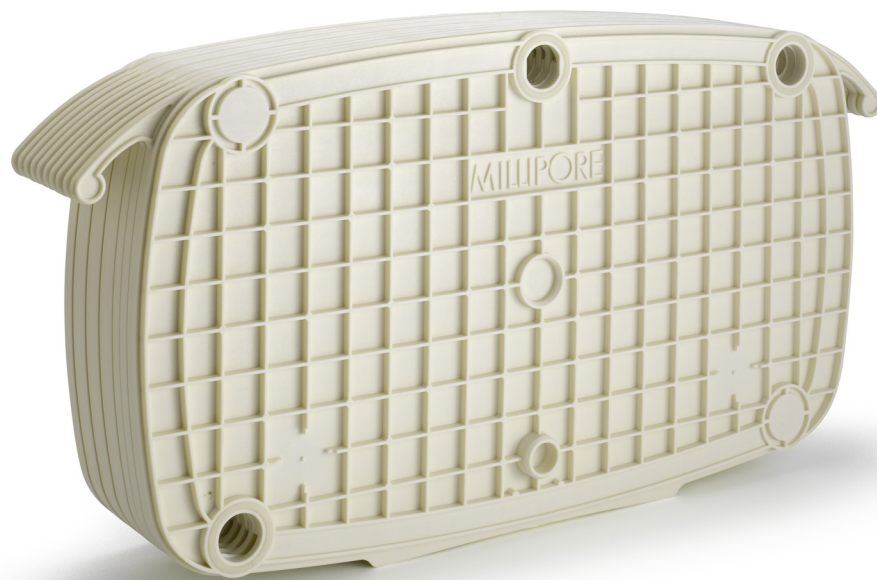
Figure 1. Millistak+® Pod Filters