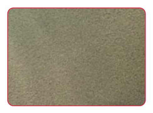
Figure 1. Monodisperse microspheres