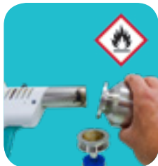
Flaming funnel base and inside