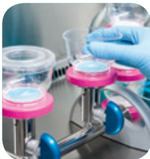
EZ-Fit® Filtration Unit set-up