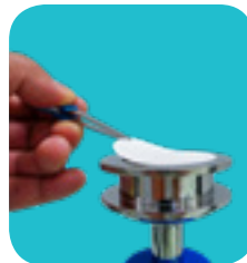
Placing filter on manifold head