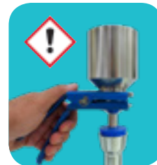
Installing filter funnel on manifold