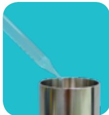
Cooling time with sterile water