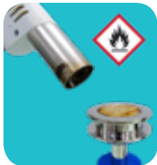
Flaming manifold head

Be careful when installing the funnel on the manifold, you might clip your fingers.