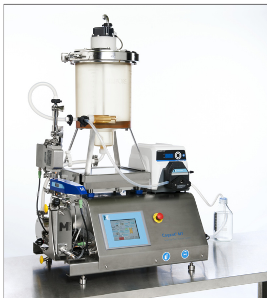
Cogent® M1 Tangential Flow Filtration System

The Cogent® M1 system meets the requirements of the Low Voltage Directive 73/23/EEC and the EMC Directive 89/336/EEC, and is CE marked.