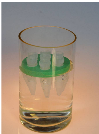
Figure 2: Dialysis with Maxi Pur-A-Lyzer.