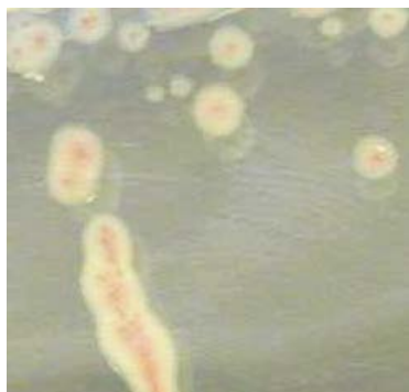
Figure 2: Colonies of Bifidus longum