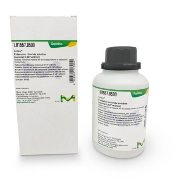
Table 7. Conductivity Standards