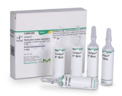
Table 18. Refractive Index Standards