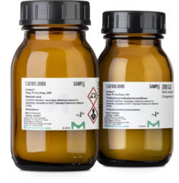
Table 2. Volumetric Standards