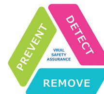
Figure 1. Safety Triangle

retroviral-like particles, and the clearance of these particles, or a surrogate virus, must exceed the number of particles in the bulk harvest. Viral clearance studies for non-enveloped viral vectors have been performed less frequently. Therefore, the virus inactivation steps and the model virus panel to be used for clearance studies may not be as clear. We address some of the questions with respect to viral clearance studies for AAV vectors below.