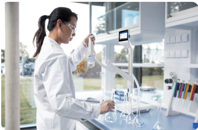
Milli-Q® IQ 7003/05/10/15 fully integrated pure and ultrapure water system.