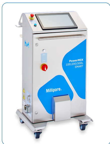
Figure 1. Smart control box

Recipe-driven automation eliminates manual operations, increases reproducibility, and minimizes risk of errors. Reports can be easily generated from scratch or from pre-defined templates. An interactive P&ID allows users to visually monitor the process and control each of the components from the Human-Machine Interface (HMI) or from anywhere through a browser-based interface.