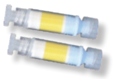
BPE-DNPH Rezorian® cartridge