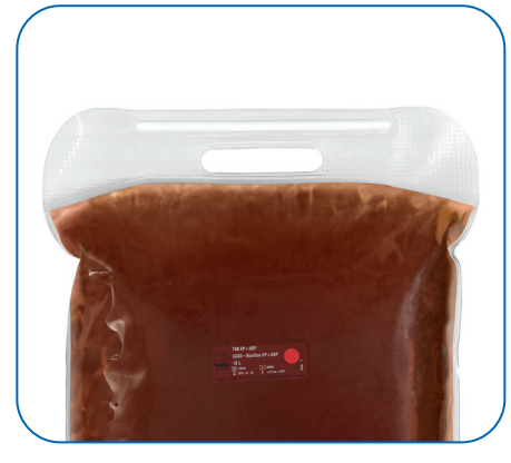
Handle at top of bag for convenient use