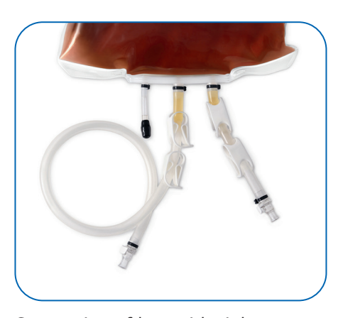
Connection of bag with: inlet tubing, outlet tubing, and injection port (from left to right)

The self-collapsing bags include an 80 cm long tube with an MPC connector (male insert 3/8"), which enables direct connection to the filling line. An injection port with a septum allows the supplementation of the broth medium, for example with neutralizers, antibiotics inactivators, or growth supplements.