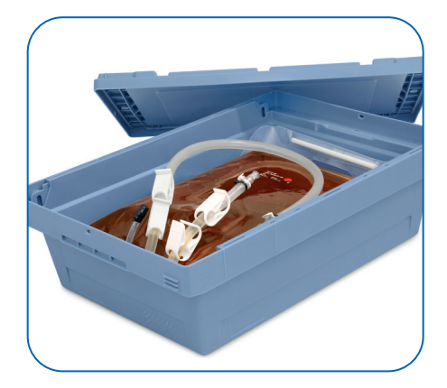
10 L bag containing TSB in transport box