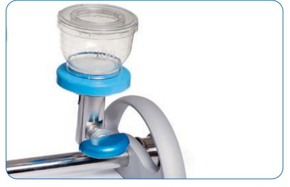
One handed funnel removal