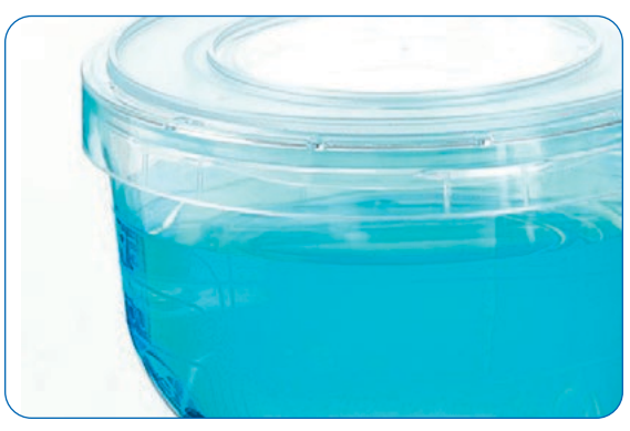
Vented lid on the device during filtration