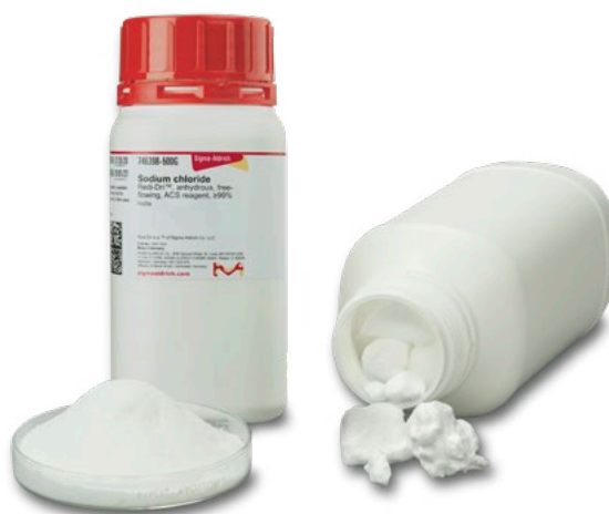
LOD Time Study of the Redi-Dri™ Packaging System

The results indicate that the Redi-Dri™ material had lower LOD values and remained free-flowing throughout the test period as compared to the standard-packaged material, which had acquired a higher moisture content and hardened, caked characteristics.