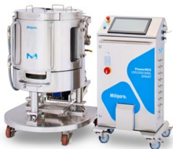
Figure 2. Mobius® Power MIX 200 with Smart control box

Both ready to connect and smart control boxes are separate boxes on a four wheels chassis that can be easily moved around the Mobius® MIX carrier. Optimize your layout and get a better access to control your Mobius® mixing system by freely positioning the control box around it.