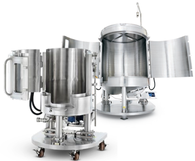
Figure 1. Mobius® Power MIX 2000 has double doors that open to one half the diameter of the carrier; the Mobius® Power MIX 100, 200, and 500 have a single door that opens to one half the diameter of the carrier.