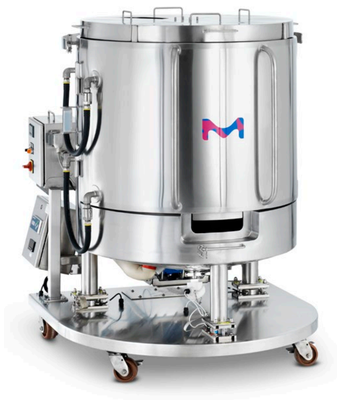
Figure 4. Mobius® Power Mix 500

Purchasing spare parts directly from us is the only way we can guarantee that you get the right parts every time, with the same level of performance as the original. For details and ordering information, check the illustrated spare parts list (MK_CA7420EN).