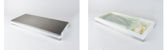
Mobius® 2D Freeze Assemblies are compatible with RoSS® (Robust Storage and Shipping) Shells from Single Use Support GmbH.

During testing, the Mobius® bags were placed into their compatible RoSS® shell and filled with water. The 3D Foam inlays the RoSS® shell covers the tubing section, the shoulders, and the back end of the bag. Freezing and thawing were performed with plate freezer technology. During this process, the liquid expands, the bag gets pressed against the foam, and the foam becomes hard at sub-zero (<0 °C). The bag, therefore, is fully immobilized at frozen state.